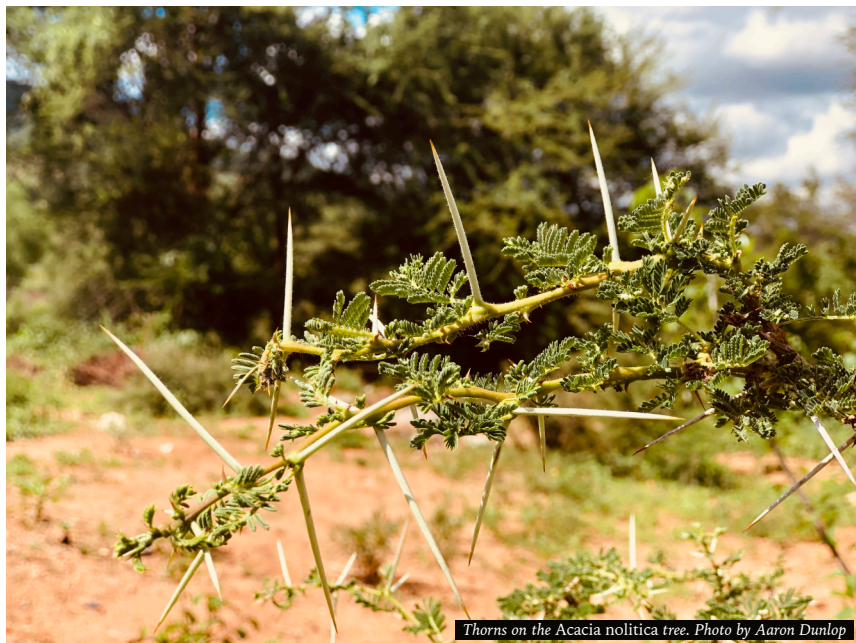
Thorns on the Acacia nolitica tree.

Vol. 5, No. 1, January–March 2025. Editor: Aaron Dunlop.