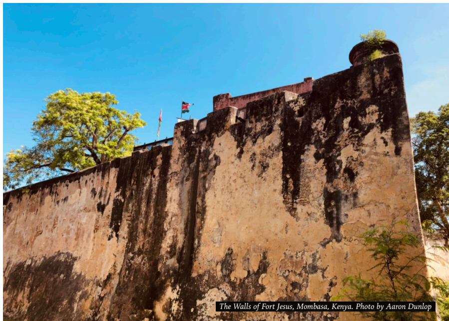
The Walls of Fort Jesus, Mombasa, Kenya.

Vol. 4, No. 3, July–September 2024. Editor: Aaron Dunlop