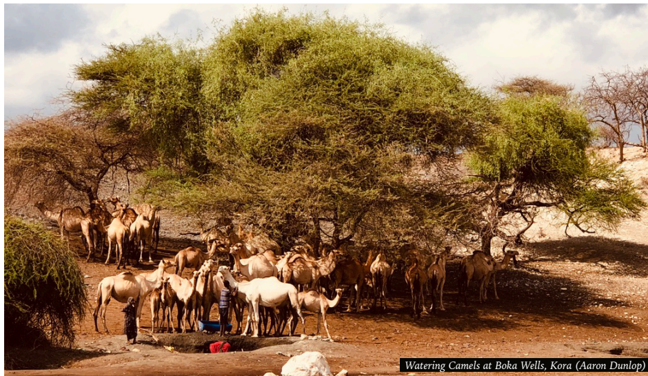
Watering Camels at Boka Wells, Kora