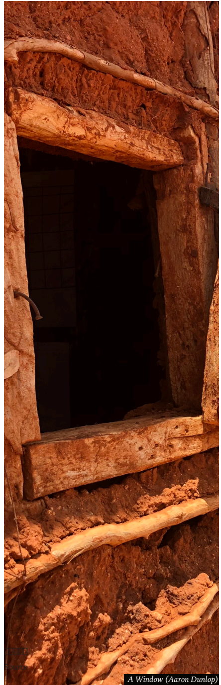
A Window