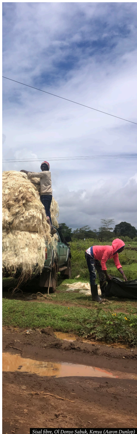
Sisal fibre, Ol Donyo Sabuk, Kenya

Having undertaken to make satisfaction to his Father for the wrong done him in his honour by the sin of man, he did it by denying himself in, and despoiling himself of, the honours undoubtedly due to an incarnate Deity.